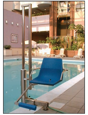
U.S. PAT. #5,465,433

The Americans with Disabilities Act requirements for public pools include pool access via pool lift, zero-depth entry, or both. The ADA requirements for pool lifts include independent operation and easy seat retrieval from deck or water. The IGAT models on this page meet or exceed ADA requirements, and feature upper and lower controls within easy reach from deck or water, with no need to reel in a single control box from the opposite location. Lifts are powered by water pressure (max. 70 PSI) from a hose connection to a faucet or plumbed-in line. Water pressure requirements and rated loads vary depending on weights of optional accessories. Installation requires anchor socket in deck; socket and cover are included. Pool/spa sketch with dimensions is required.